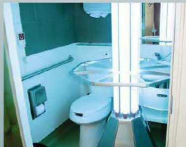
Irradiate patient rooms, bathroom and ORs