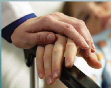
Disinfect high-touch areas that may contribute to HAIs