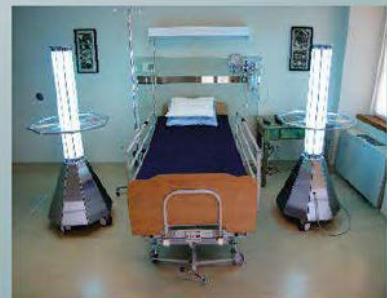
No need to reposition while disinfecting entire room